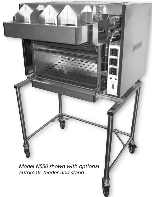
Model N550 shown with optional automatic feeder and stand

7950 Cameron Drive Windsor, CA 95492 707.284.7100 Fax 707.284.7430 www.nieco.com email: sales@nieco.com Re-order P/N 9999-99162 4.04