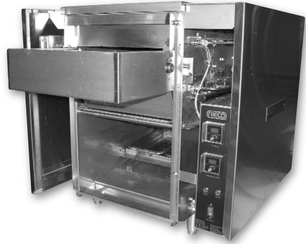
Model N512 shown with optional feeder and product holding pans

7950 Cameron Drive Windsor, CA 95492 707.284.7100 Fax 707.284.7430 www.nieco.com email: sales@nieco.com Re-order P/N 9999-99168 8.03